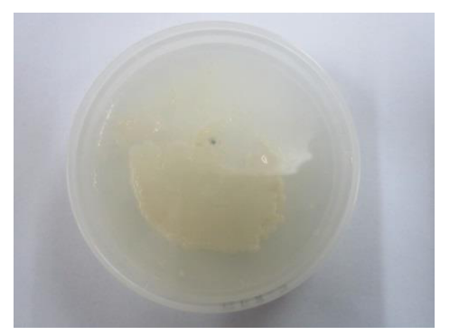
Fig1: Actinomycetes colony isolated on agar plate

# Lower fiducial limit; * upper fiducial limit